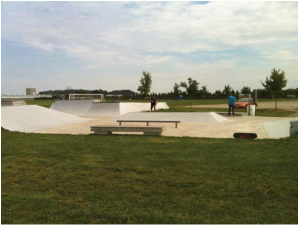
banks leading into a ledge and rail