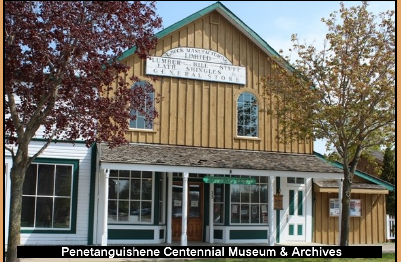
Penetanguishene Centennial Museum & Archives