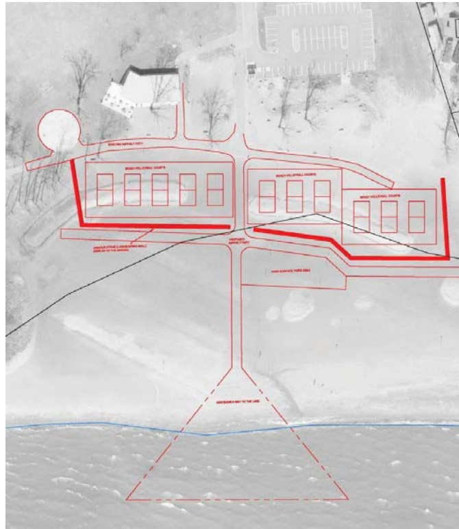
Figure 2 : Accessibility Mats- Wasaga Beach, Ontario