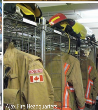
Ajax Fire Headquarters