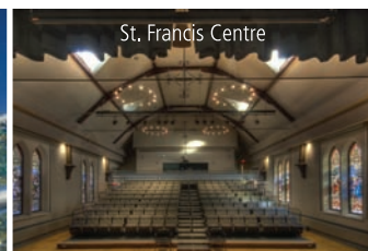
St. Francis Centre