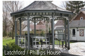
Latchford / Phillips House