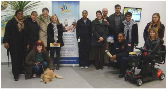
Accessible Ajax in the community: Visiting the new Abilities Centre in Whitby