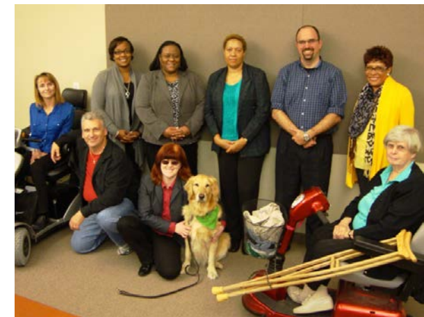
2011-2014 Town of Ajax Accessibility Advisory Committee

The public is invited to attend AAC meetings. Meetings are held the third Wednesday of the month at 6:00 p.m. at Ajax Town Hall. Full meeting schedule, agenda and minutes are available on the Town's website . Alternate formats available upon request by contacting: accessibility@ajax.ca .