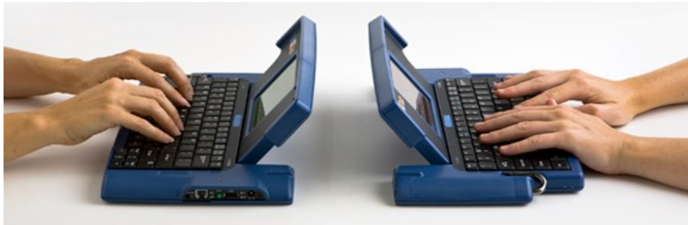
Image of two individuals using the UbiDuo device to communicate.

The UbiDuo is a communication device that enables people who are deaf/hard of hearing to communicate instantly with anyone, face-to-face, without a third party. Up to four people can participate in a conversation at one time. "Type-to-text" displays simultaneously on each split screen in 'real time'. The UbiDuo has a wireless range of 500 feet, 6 pounds or portability and is effortless to use, making it a great solution for anyone with communication barriers. Did you know that the UbiDuo is part of the equipment available at the Ajax Public Library Main Branch accessible work station? For more information visit www.ajaxlibrary.ca .