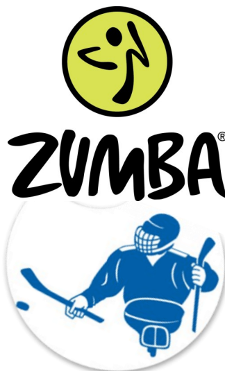
Photo of Audley Recreation Centre Pool (left); Zumba Logo (top right); sledge hockey clip art. (bottom right).