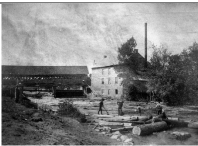
Martintown Mill & Bridge

In recognition of the important role the Martintown families and descendants have played in the establishment and development of Martintown and Munroe's Mills we are pleased to invite you to participate in this day of celebrating Martintown and rediscovering / sharing your contribution to this community.