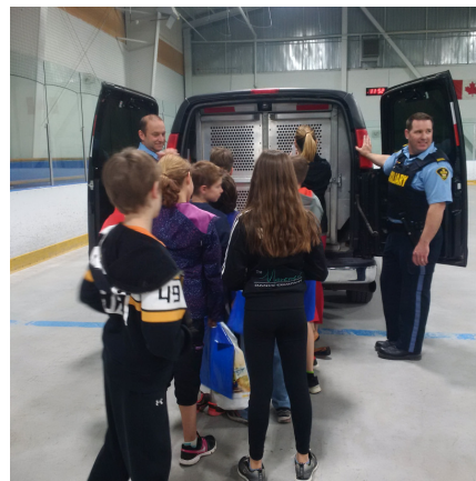
Wellington County O.P.P. auxiliary members with a police vehicle on display