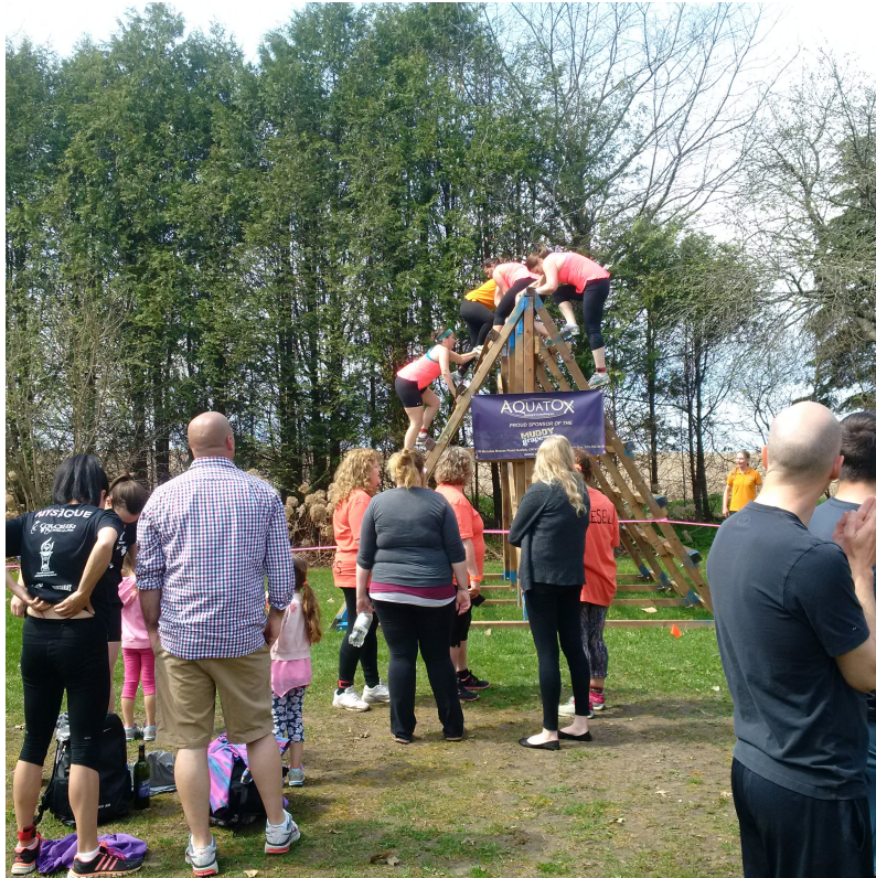
One of the many obstacles at the 2016 Muddy Grape run being conquered by the participants