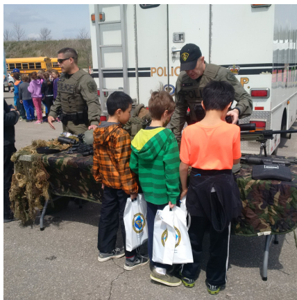
ERT Team Members displaying their equipment

This year, Ontario's theme is "Emergency Preparedness starts with you, Prepare Yourself!" This campaign is intended to engage everyone across the province about emergency preparedness, and to raise awareness about action and accountability in a manner that is both interactive and entertaining.