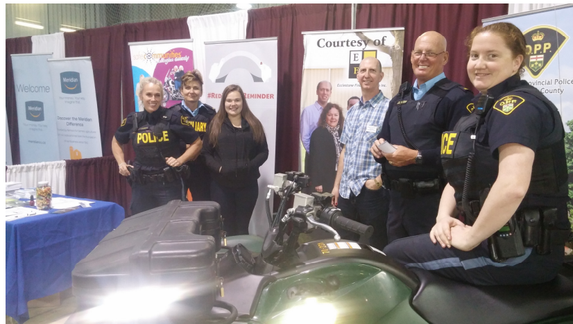
Wellington County O.P.P. officer and auxiliaries at the 2016 Fergus Lions Home Show