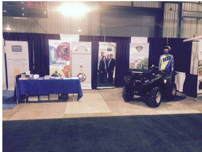
The Wellington County O.P.P. display at the 2016 Fergus Lions Home Show

The 2016 Fergus Lions Home Show was held from May 4 th to 6 th at the Centre Wellington Community Centre Sportsplex. Wellington County O.P.P. attended the event and set up a display; Wellington County O.P.P. officers and Auxiliary Constables were on site to interact and answer questions from those in attendance.