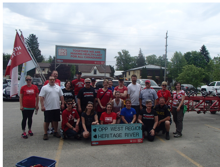
The 2016 Heart and Stroke Foundation Big Bike Team

On May 25 th , the Heart and Stroke Foundation Big Bike event was held to raise money for the foundation and to raise awareness for this great cause. Wellington County O.P.P. once again participated with a group of enthusiastic volunteers that wanted to show the community that the OPP supports a healthy lifestyle.