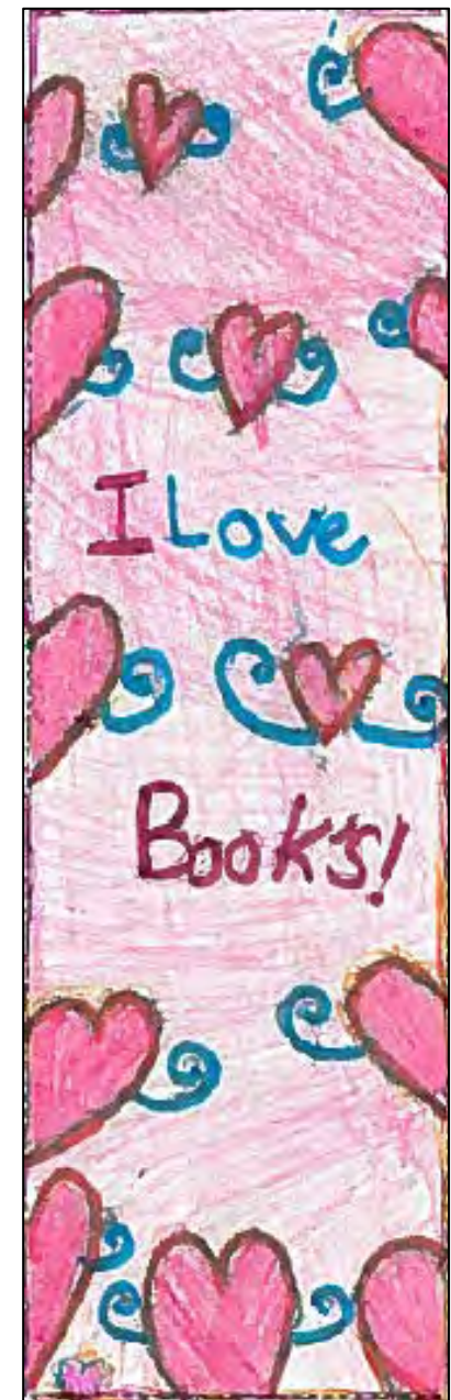
Dua Zehva Senior Kindergarten