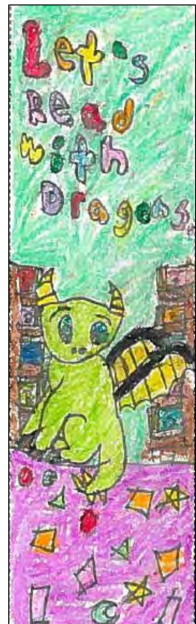
Sukainah Syed Grade 2