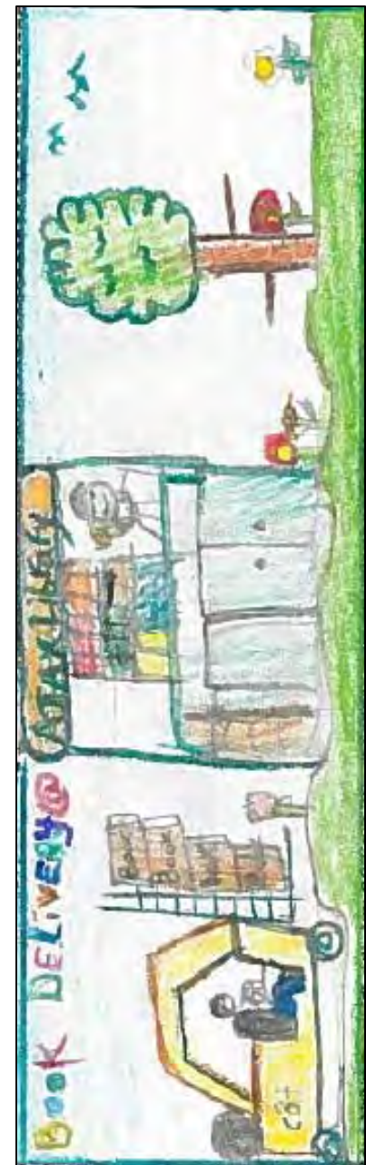
Stephane Najib Grade 2