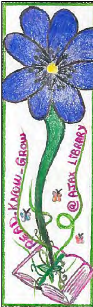
Tanya Najib Grade 6